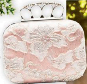
CLUTCH $49.99, Forever New (forevernew.com.au).