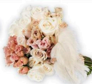
FLOWERS $180, Flowers by Teresa (flowersbyteresa.com).