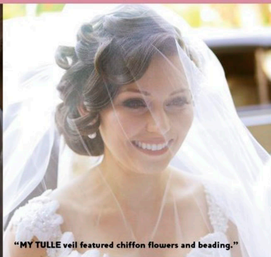
"MY TULLE veil featured chiffon flowers and beading."