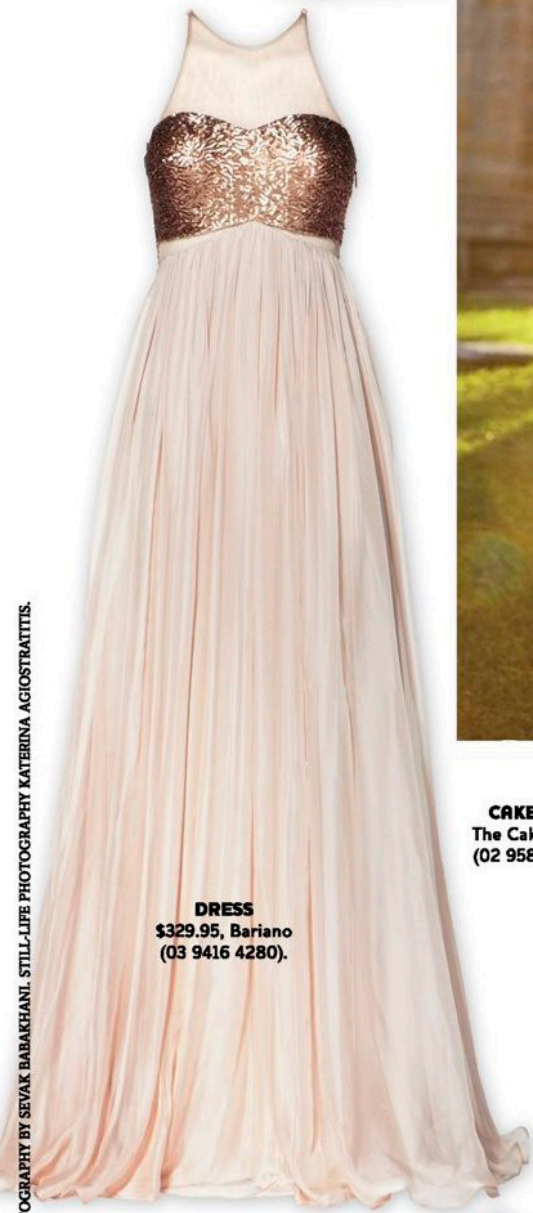
DRESS $329.95, Bariano (03 9416 4280).