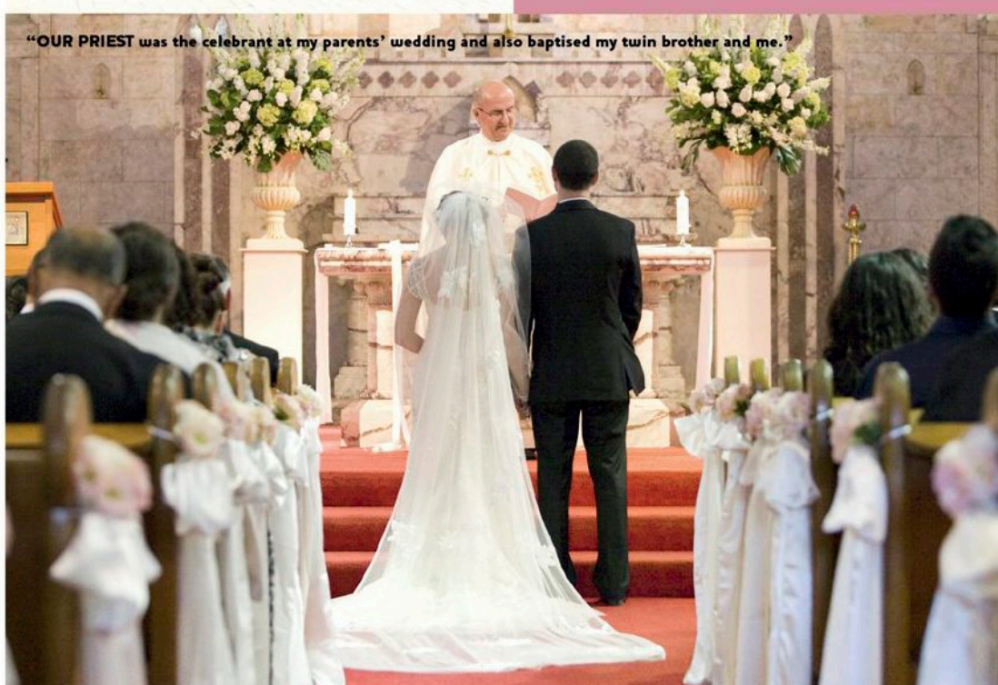
"OUR PRIEST was the celebrant at my parents' wedding and also baptised my twin brother and me."