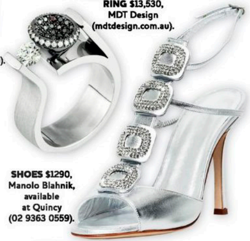
RING $13,530, MDT Design (mtdesign.com.au).