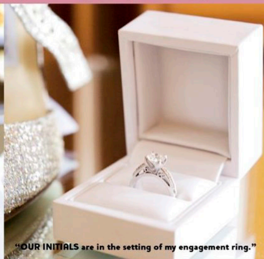
"OUR INITIALS are in the setting of my engagement ring."