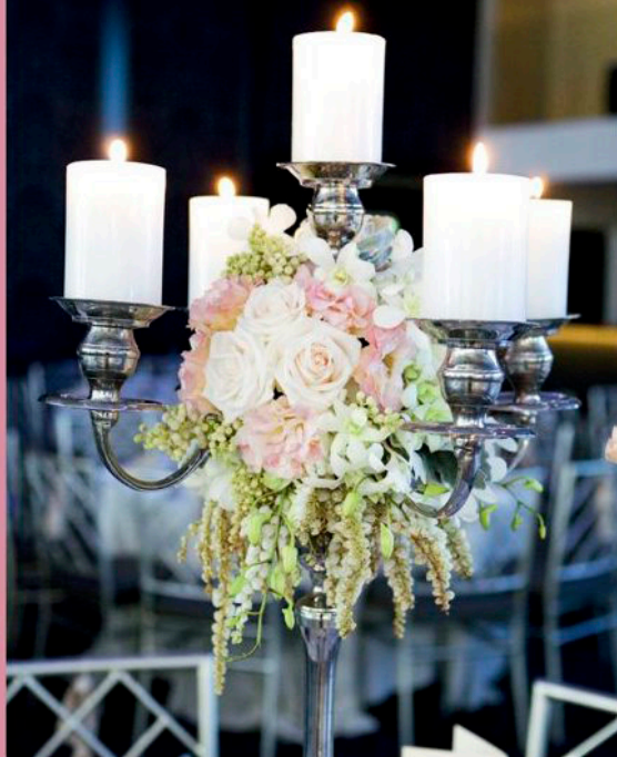
"CANDELABRAS WERE draped with roses and orchids."