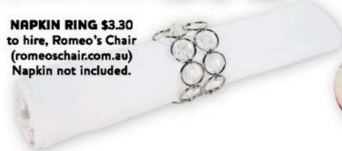
NAPKIN RING $3.30 to hire, Romeo's Chair (romeoschair.com.au) Napkin not included.