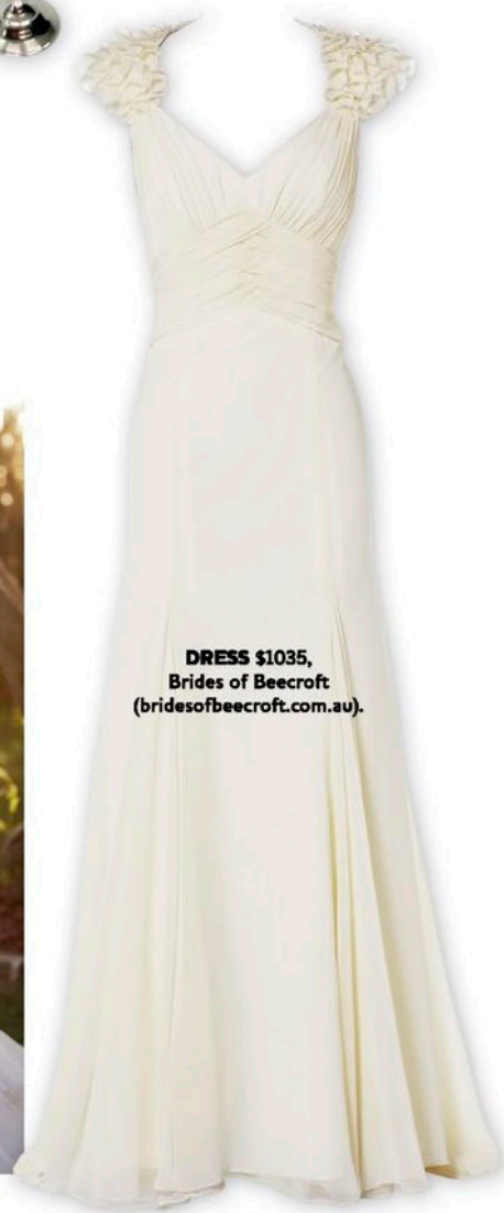
DRESS $1035, Brides of Beecroft (bridesofbeecroft.com.au).