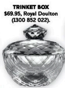
TRINKET BOX $69.95, Royal Doulton (1300 852 022).