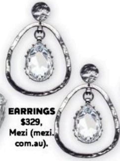
EARRINGS $329, Mezi (mezi.com.au).