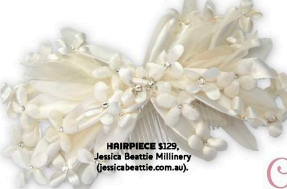
HAIRPIECE $129, Jessica Beattie Millinery (jessicabeattie.com.au).