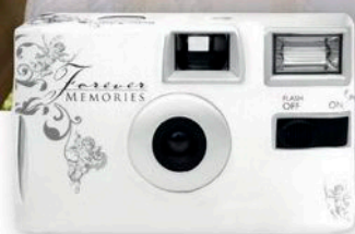
DISPOSABLE CAMERA $12, Disposable Camera Company (disposablecamera.com.au).