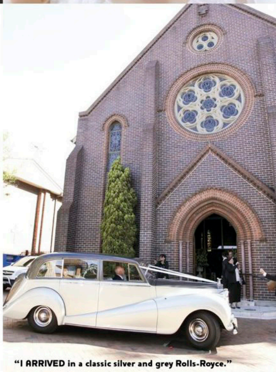
"I ARRIVED in a classic silver and grey Rolls-Royce."

CAKE "It was four tiers with a mix of chocolate and caramel mud, plus fruitcake with ivory icing embossed in an Art-Deco style."