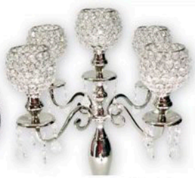
CANDELABRA $60 to hire, Divine Events (divineevents.com.au).