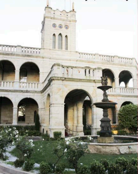
"THE VENUE was an elegant, historic setting."

Fruit platter; trio of miniature crème brûlées, chocolate mousse and vanilla-bean gelato with berries