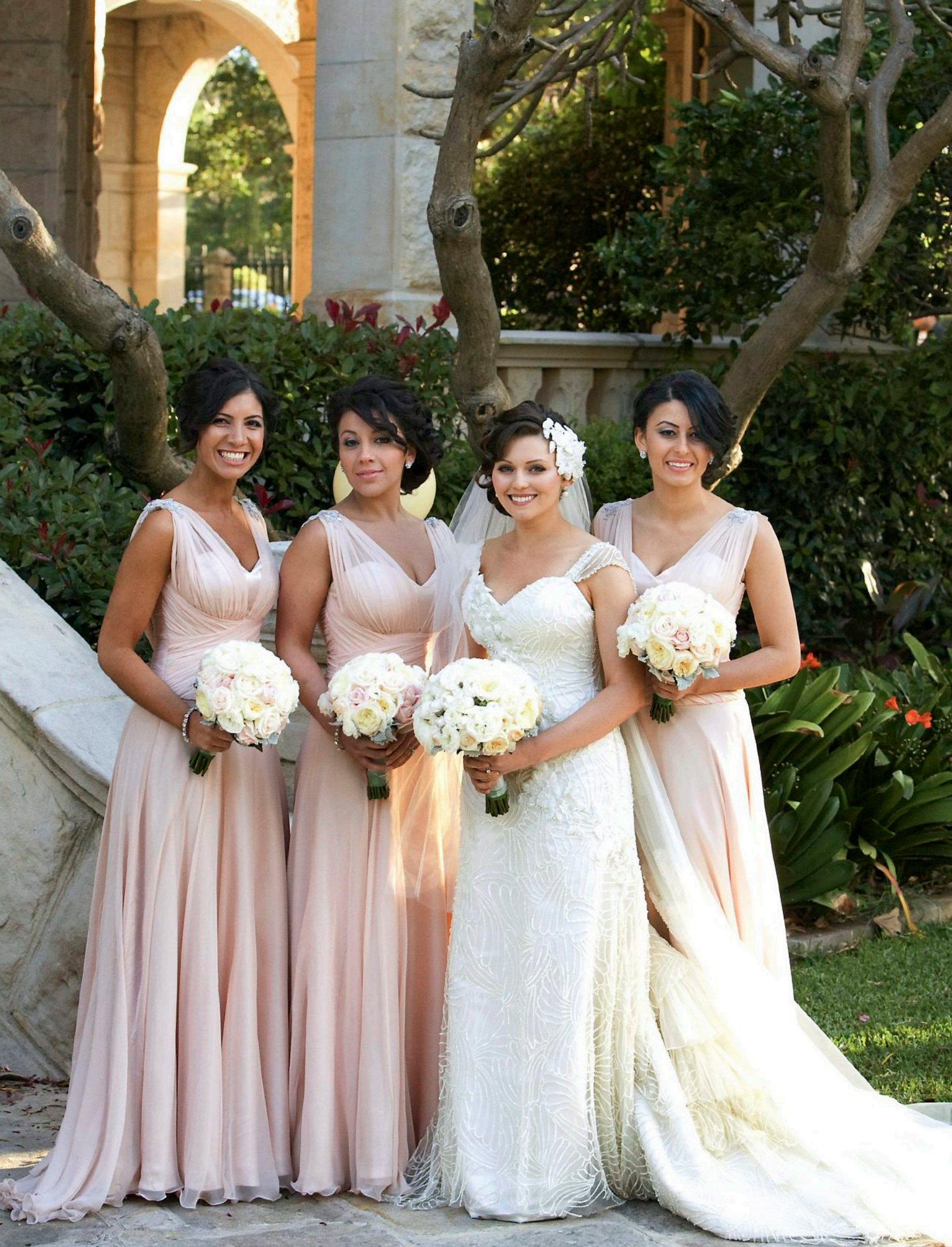
"A FAMILY friend made my gown and veil using imported fabrics. She also made the bridesmaids' chiffon dresses."