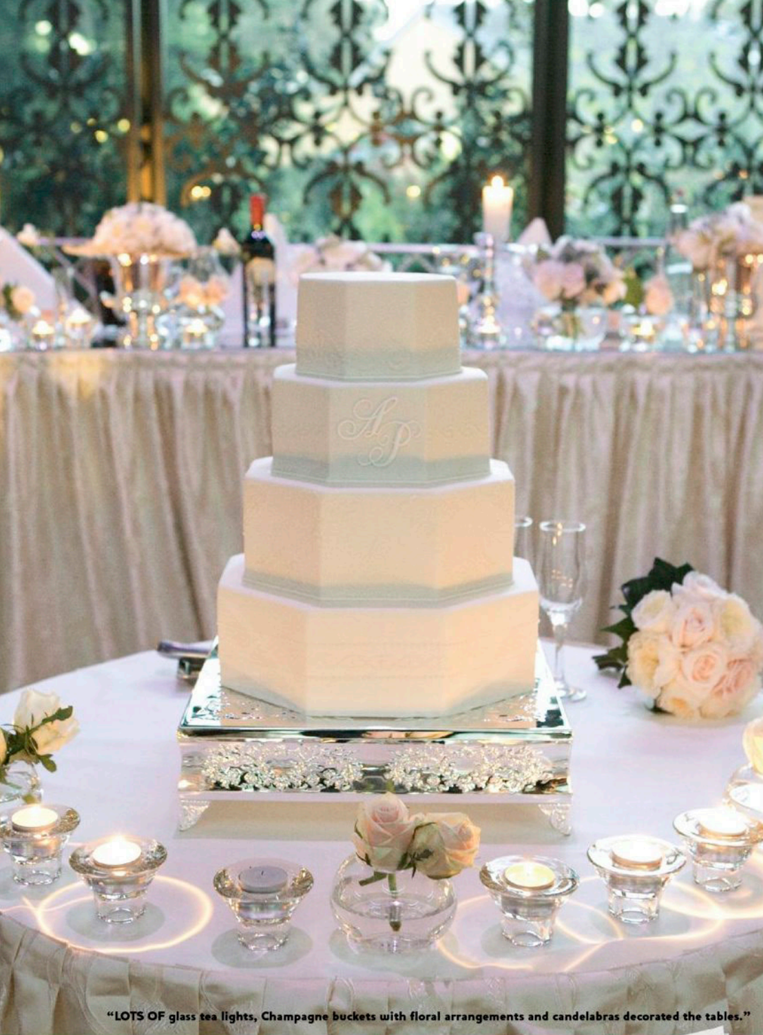
"LOTS OF glass tea lights, Champagne buckets with floral arrangements and candelabras decorated the tables."

"WE GAVE guests personalised M&M's from America."